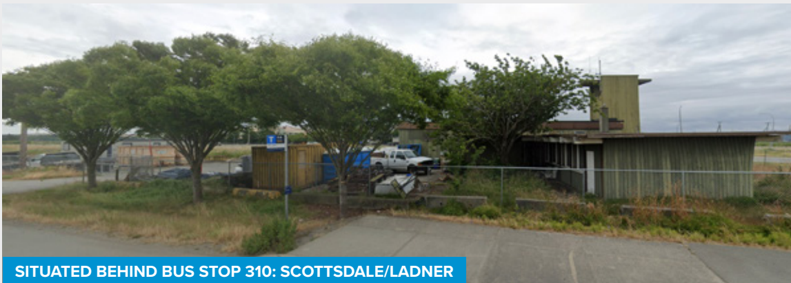
SITUATED BEHIND BUS STOP 310: SCOTTSDALE/LADNER

Exceptional build-to-suit opportunity for national quick service restaurant (QSR) or coffee chain. This 0.58 acre Highway Commercial (C4B) site offers excellent exposure and zoning that permits drive-thru restaurants and coffee shops. The landlord is open to a long-term lease with strong covenant tenants, making this an ideal site for tenants seeking a custom-built facility in a high-traffic location. Landlord may also consider offers to purchase — contact broker for details.