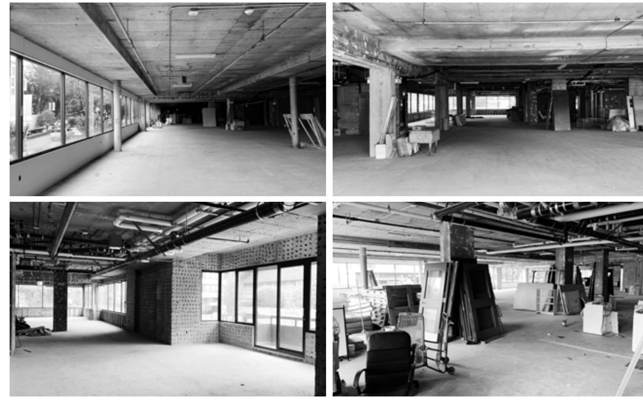
Open 2nd Floor Office Space - Vacant