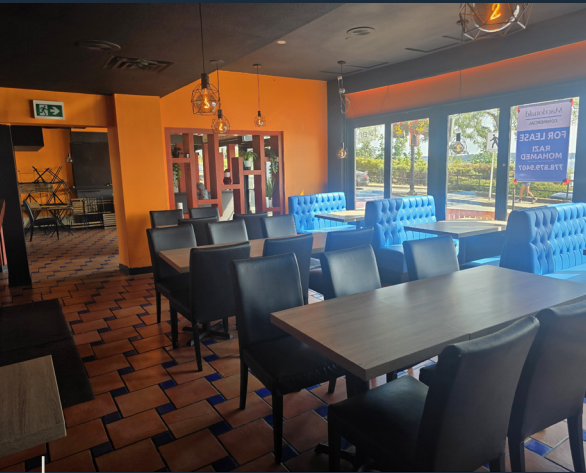
Full service restaurant