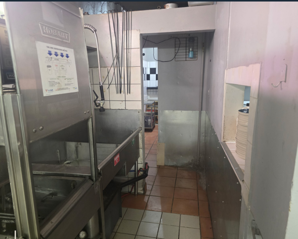
With built in infrastructure