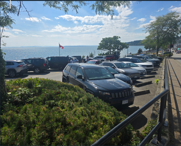
Waterfront property with great beach view