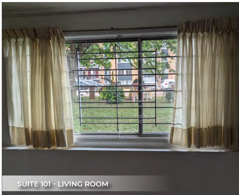
SUITE 101 - LIVING ROOM