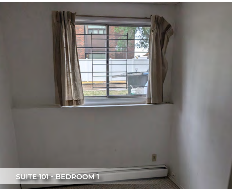
SUITE 101 - BEDROOM 1