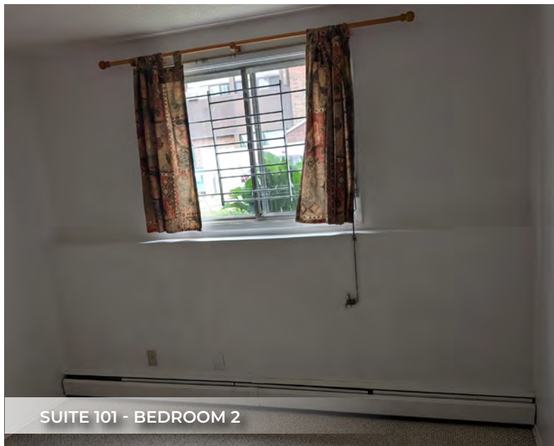
SUITE 101 - BEDROOM 2