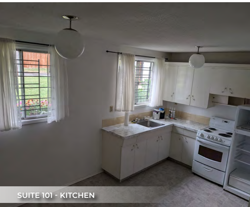
SUITE 101 - KITCHEN