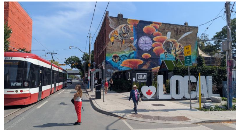
Saulter Street – Queen Garden Cafe