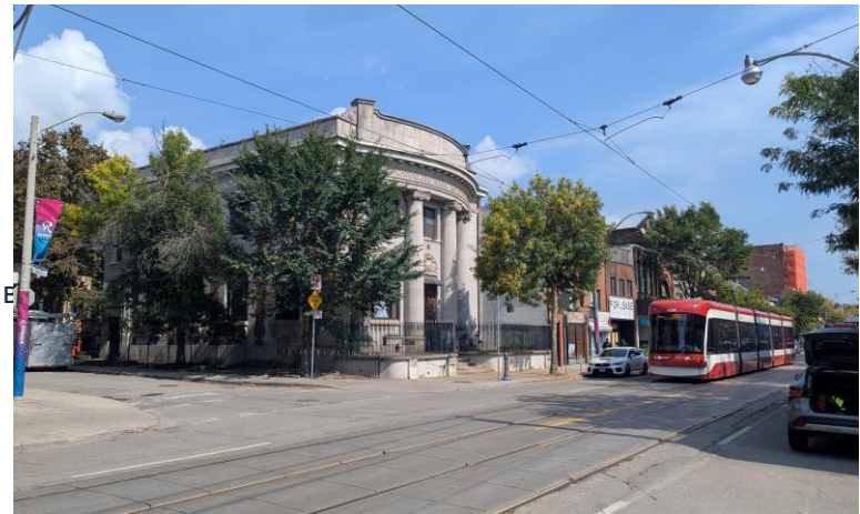
Queen Street East