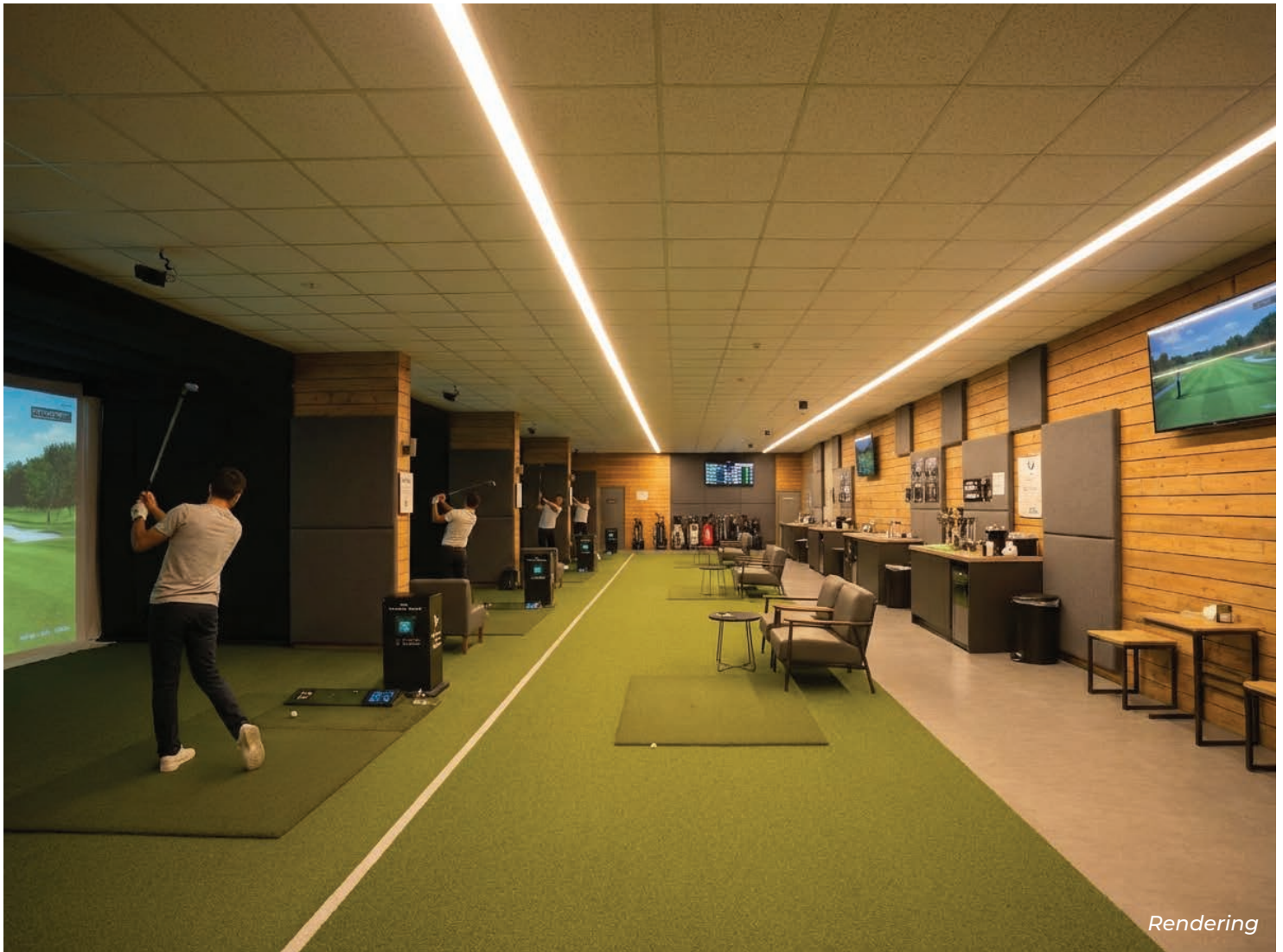
Ideal for a variety of showroom / retail & indoor entertainment