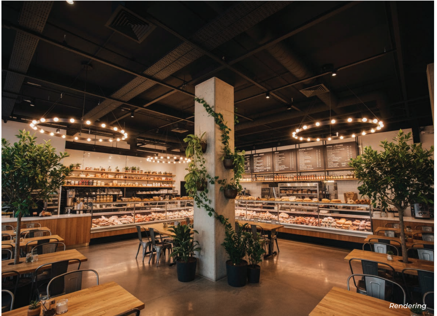
Speciality food / grocer and deli