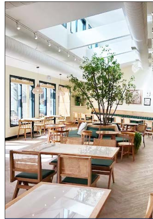
109 GARDEN BISTRO & BRUNCH DINING AREA