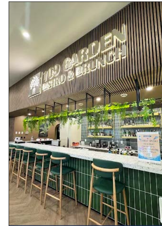
109 GARDEN BISTRO & BRUNCH BAR AREA