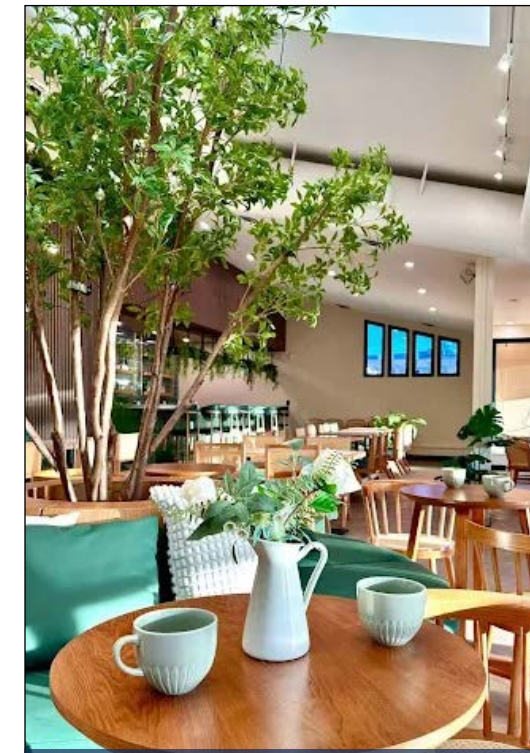
109 GARDEN BISTRO & BRUNCH DINING AREA