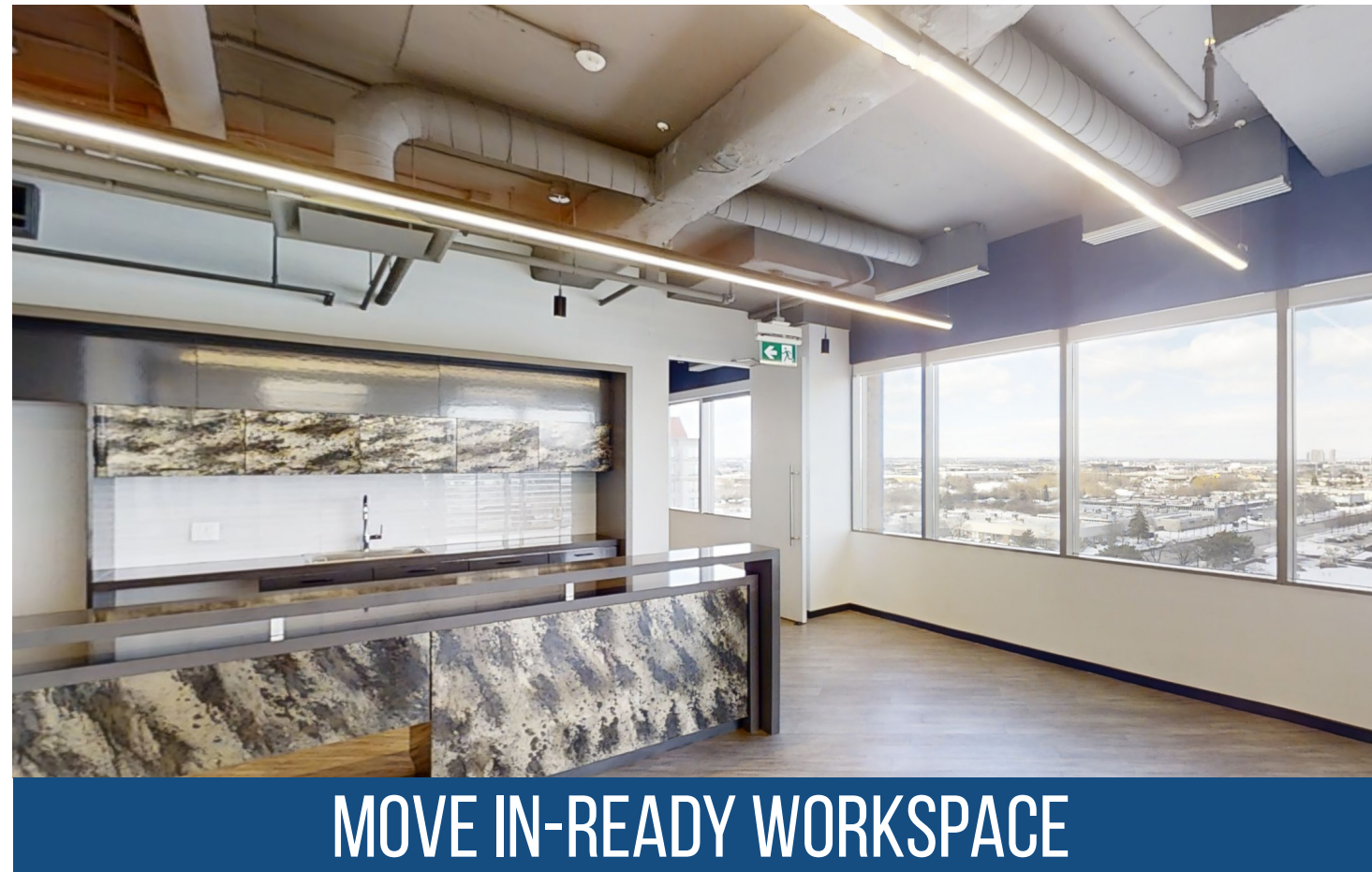
MOVE IN-READY WORKSPACE

CARLSON COURT OFFERS A THOUGHTFULLY AMENITY MIX DESIGNED TO SUPPORT PRODUCTIVITY, WELLNESS, AND CONNECTION.