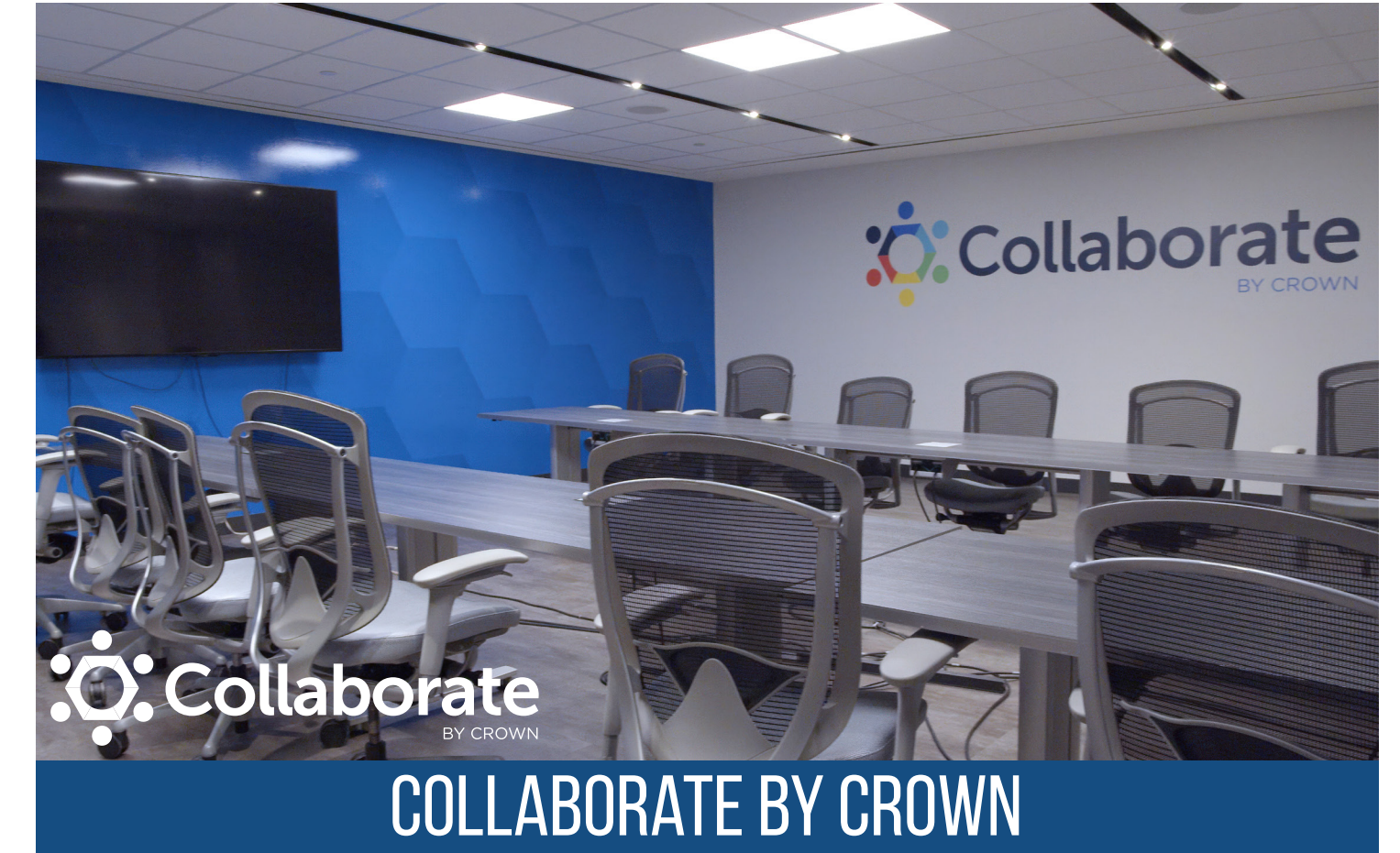
COLLABORATE BY CROWN