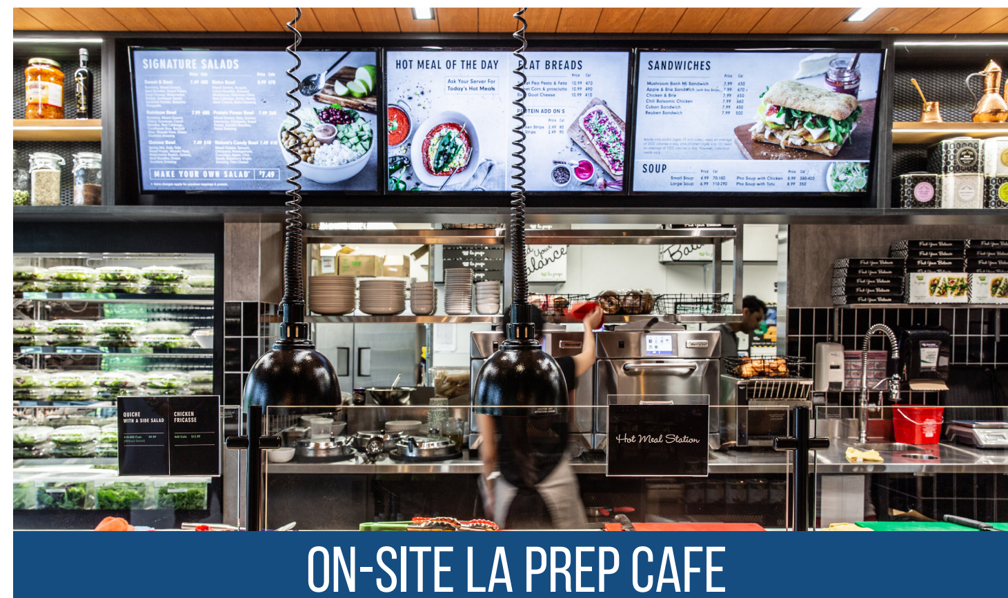
ON-SITE LA PREP CAFE