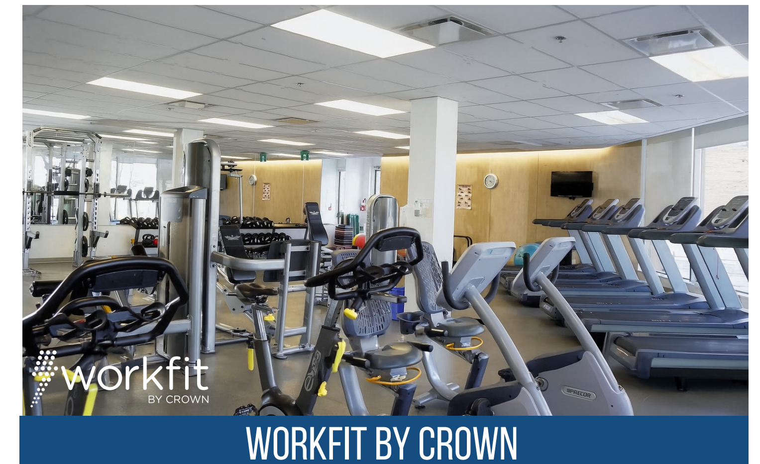
WORKFIT BY CROWN