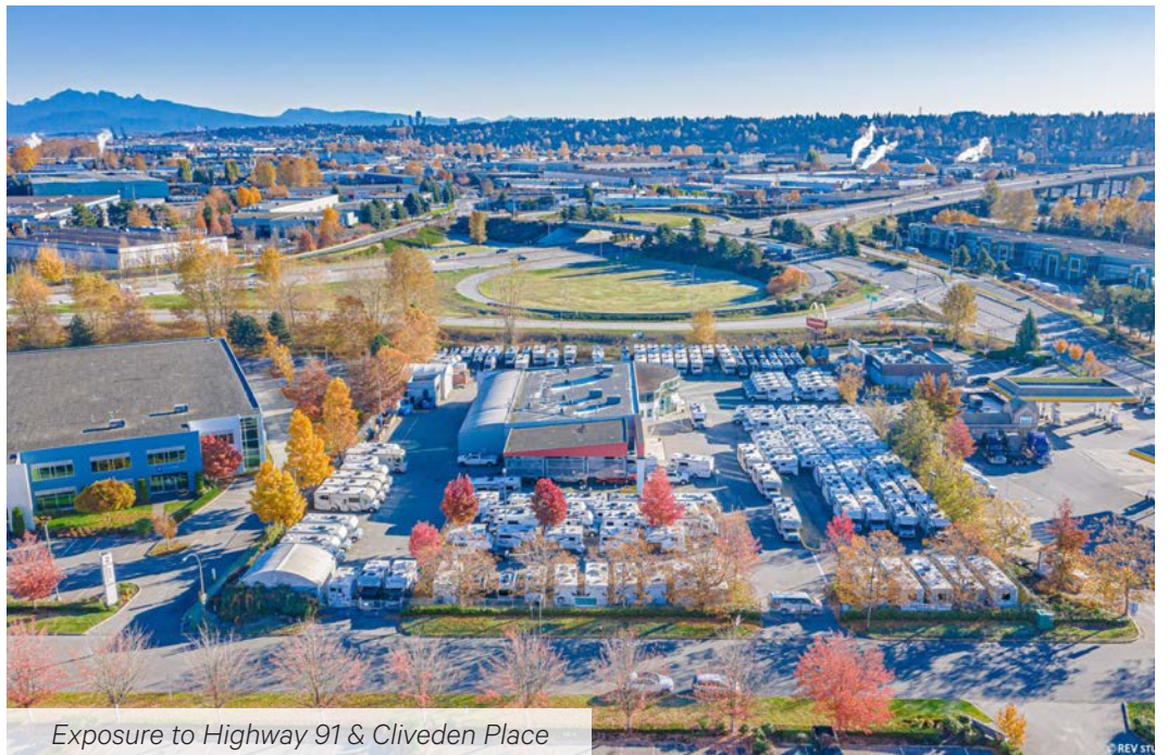
Exposure to Highway 91 & Cliveden Place