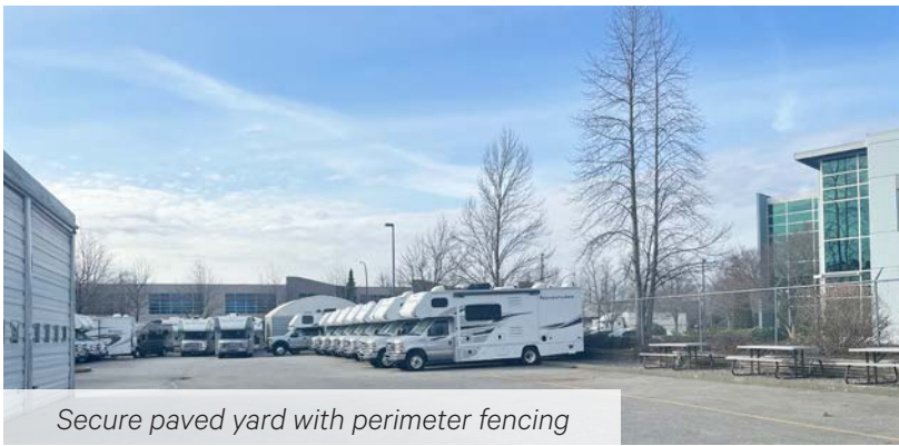
Secure paved yard with perimeter fencing