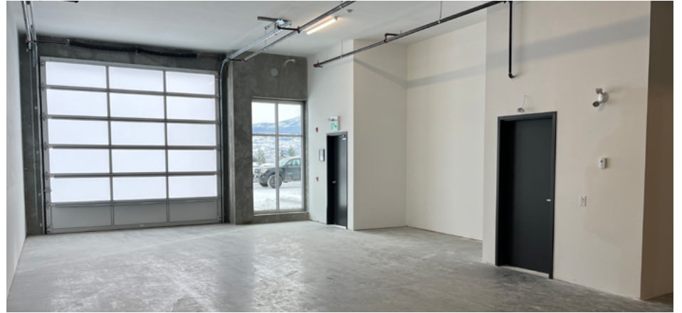
PROJECT: 105 - 3310 CARRINGTON ROAD