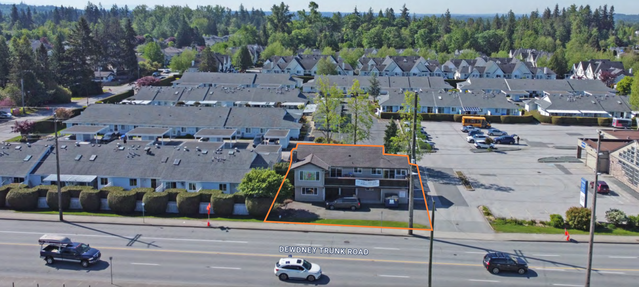
DEWDNEY TRUNK ROAD