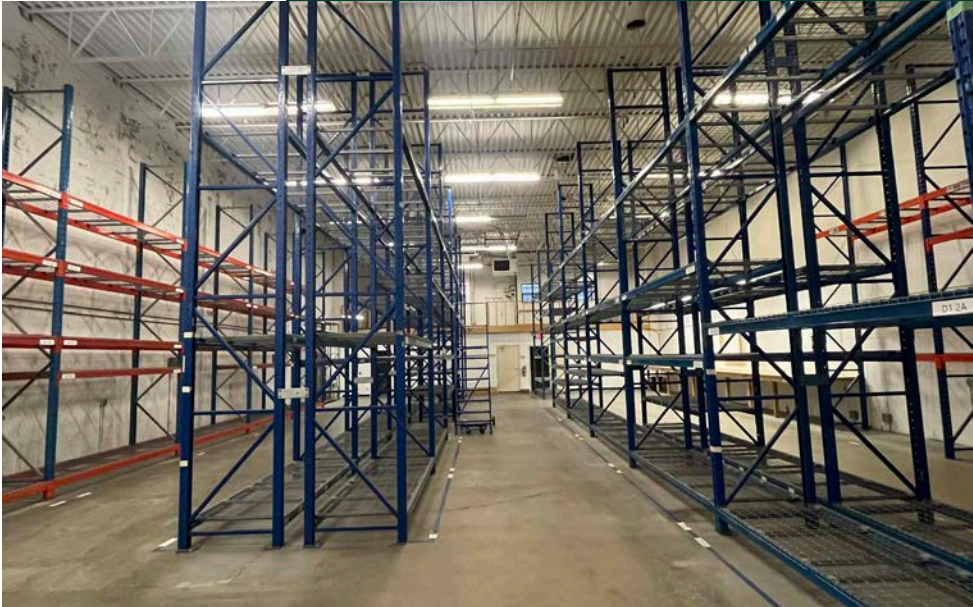
West 5th Avenue