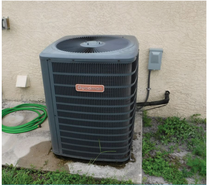
HEATING AND COOLING