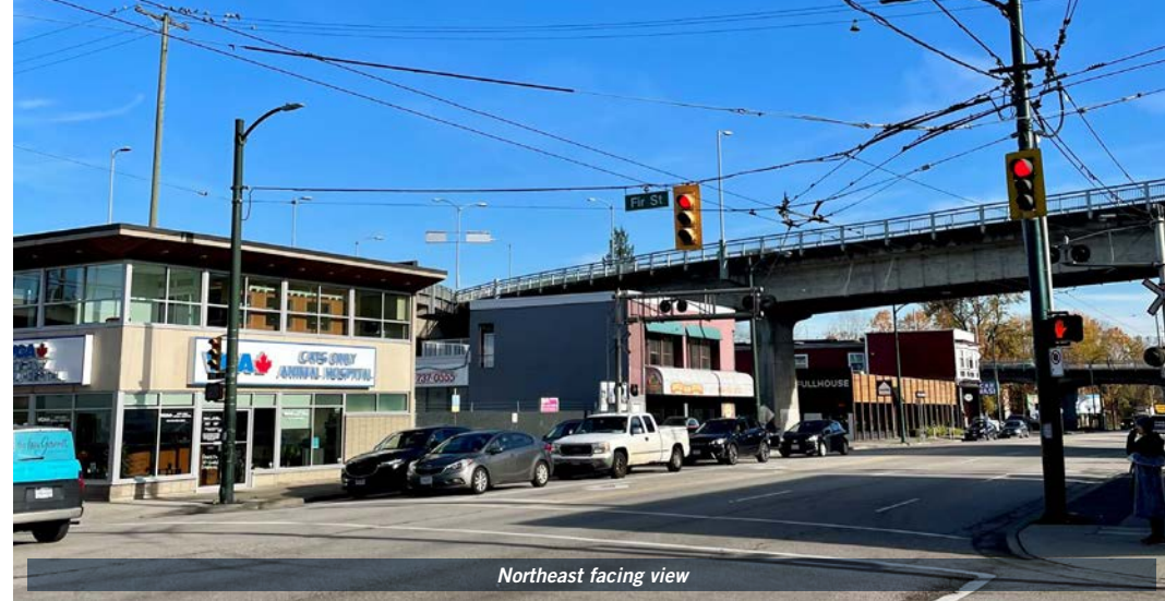
Northeast facing view

The property is located at the eastern edge of the West 4th Avenue shopping district and is only a short distance from the South Granville and West Broadway commercial districts, all of which are home to numerous retail and office tenants. West 4th Avenue is a destination retail and lifestyle district, featuring the largest collection of outdoor and active lifestyle retailers in the city, as well as numerous premiere storefronts specializing in home decor, fashion, and family goods. Neighbouring tenancies include Tesla, No Frills, Beaucoup Bakery, Tacofino, Farmer's Apprentice, Provide, Sundays Furniture, Patagonia, Surefoot, DUER, and many more.