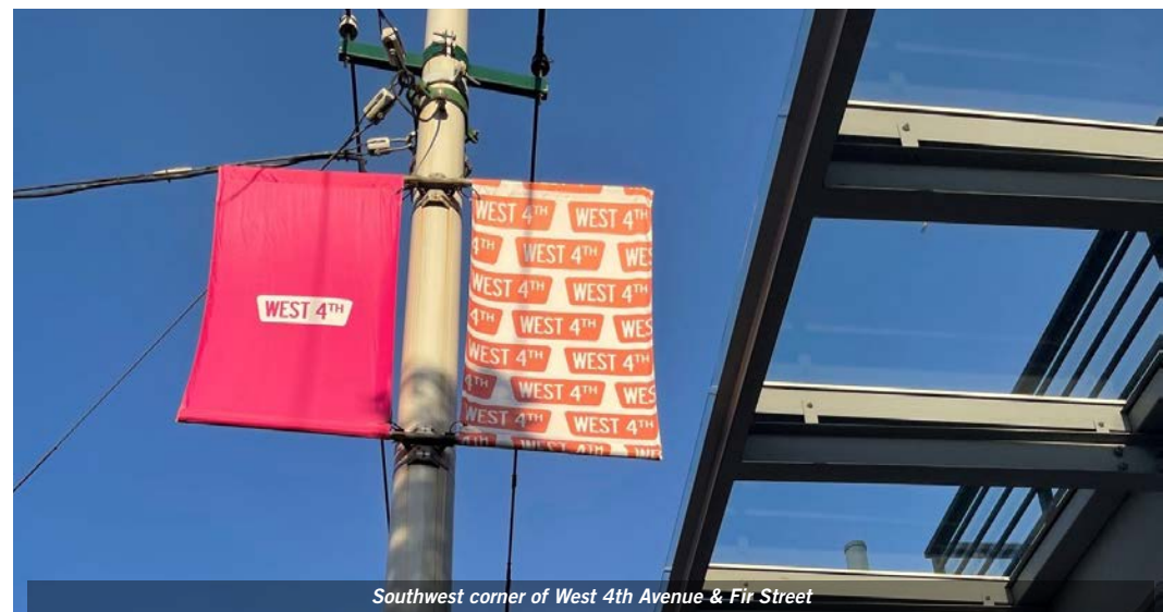
Southwest corner of West 4th Avenue & Fir Street

***Tenant is responsible for verifying permissible uses as per the zoning.