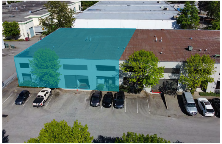
UNITS 2429 & 2431