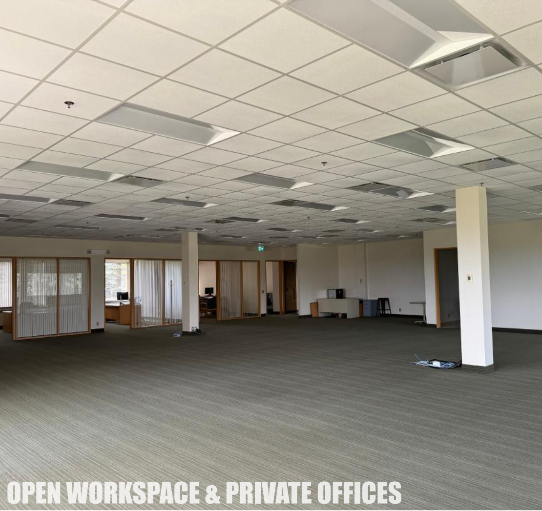
OPEN WORKSPACE & PRIVATE OFFICES