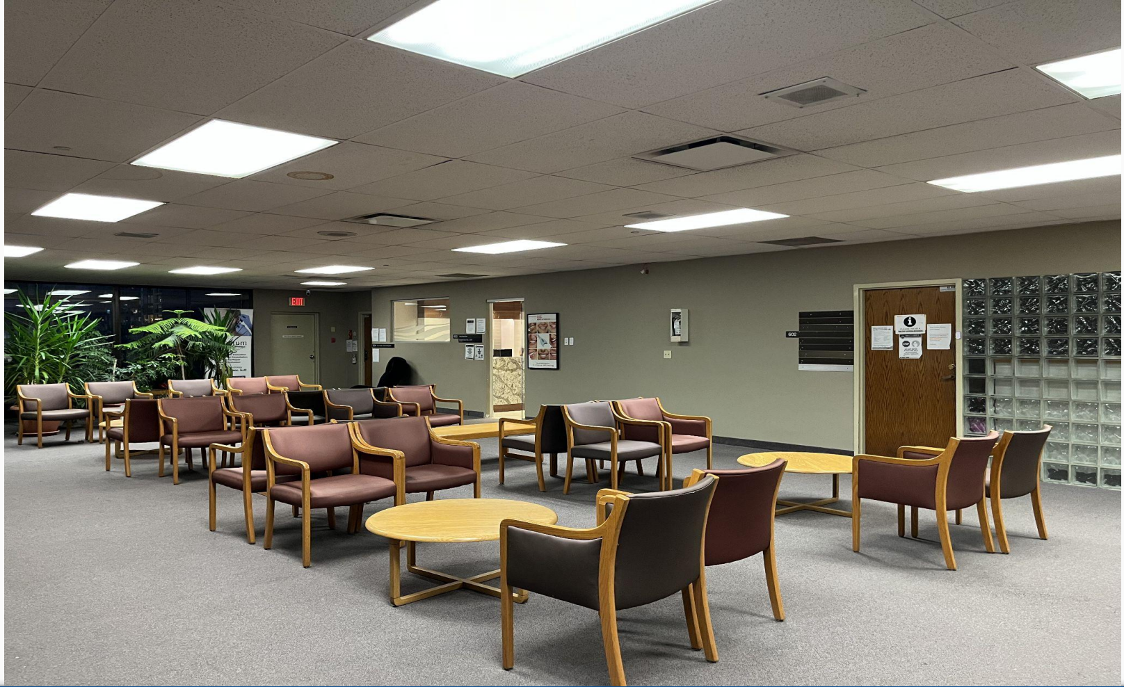
Large waiting area on every floor