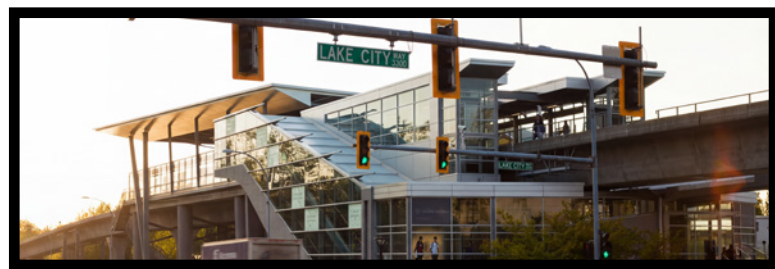
Immediate SkyTrain Access. Easy connections for employees and customers.

Prime industrial space within walking distance of the Production Way SkyTrain station is a game changer for employees and customers. It's no wonder Lake City is home to such an amazing variety of industry, including high-tech, life sciences, and film production. Burnaby anticipates adding 100,000 people and 50,000 jobs by 2050, and Lake City has been identified as a key hub for development.