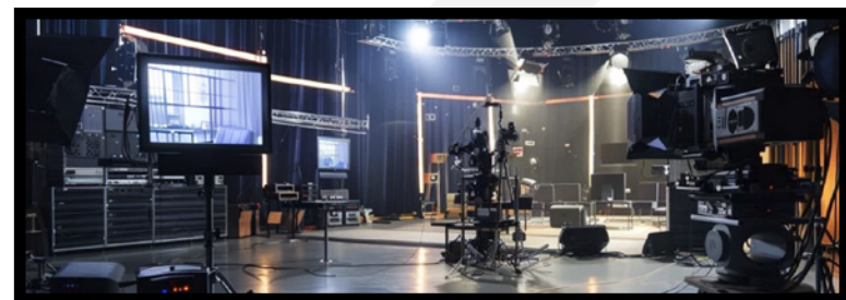
Lights, camera, action! Lake City Way features the largest purpose-built film studio in North America.