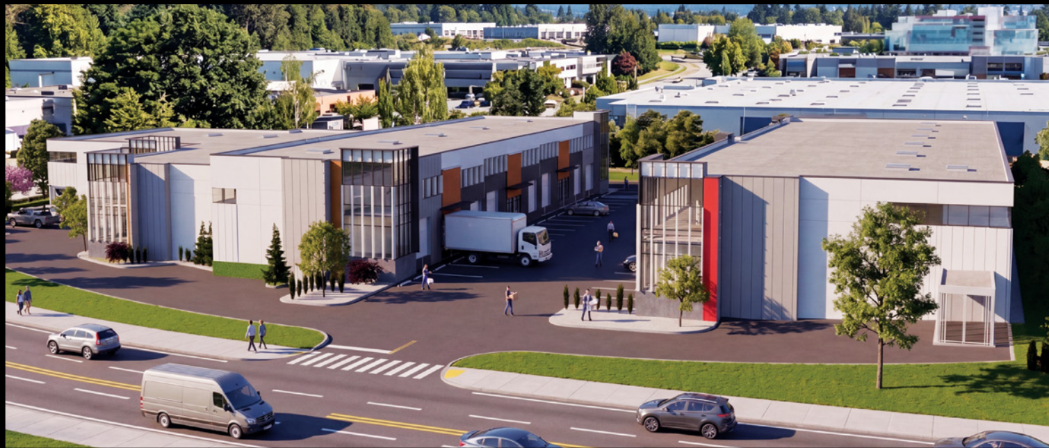
Building Two & Building Three