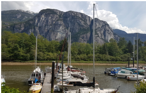
Squamish Chief (East)

PID: 011-321-997 TAXES: $30,600 (2021) PRICE: $8,500,000