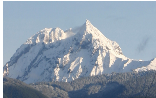
Mt. Garibaldi (North)