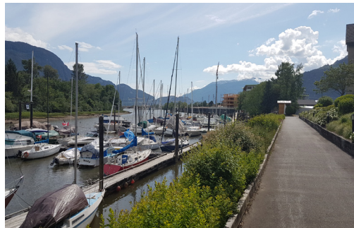
Mamquam Blind Channel (South)