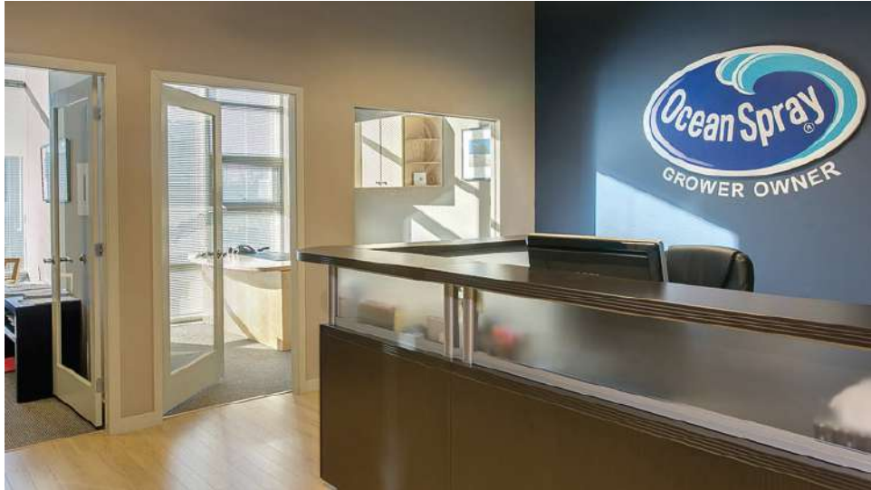
High Ceilings, with lots of Bright Natural Light