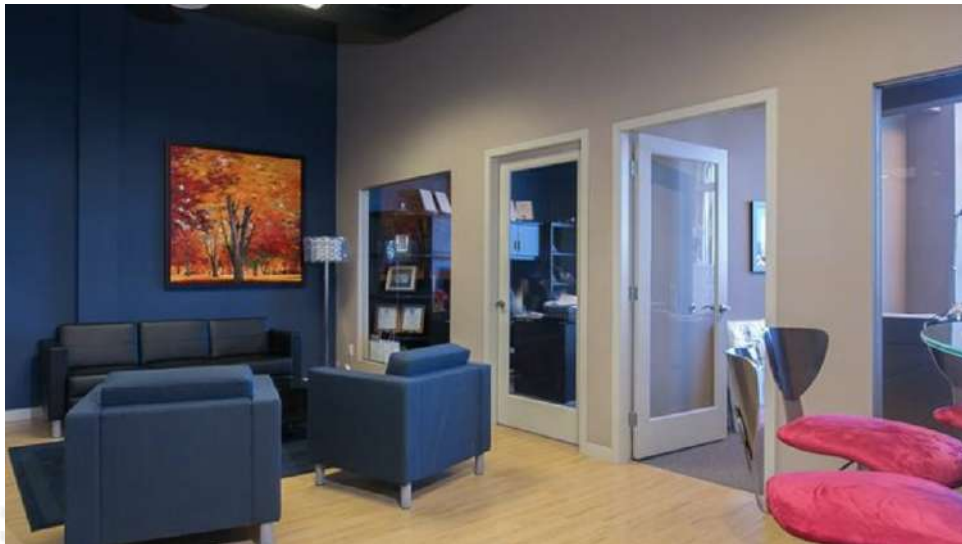
Comfortable Mix of Open Plan and Separate Offices