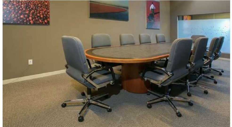
Fully Turn-Key with High-end Finishes and Some Furniture Included