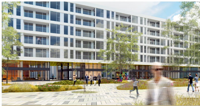
MAIN ENTRANCE ON PLACE ALICE-GIRARD