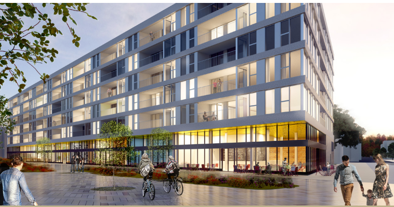
CORNER WISEMAN AND PLACE ALICE-GIRARD