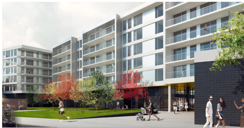
ENTRANCE ON MANSEAU