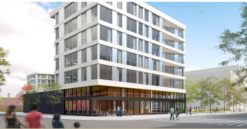
CORNER OUTREMONT AND MANSEAU