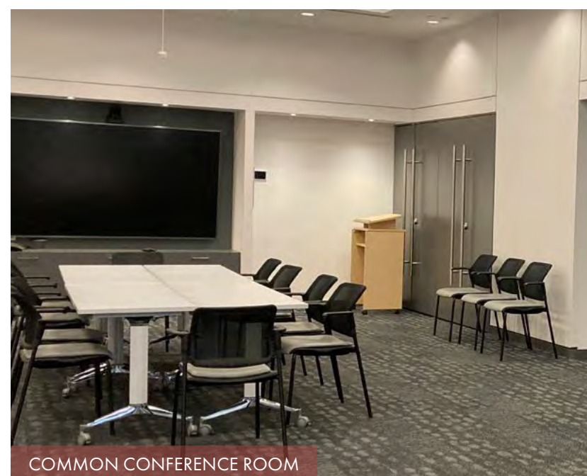
COMMON CONFERENCE ROOM