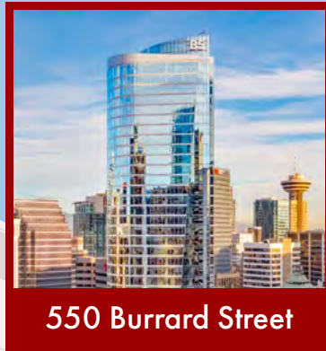
550 Burrard Street