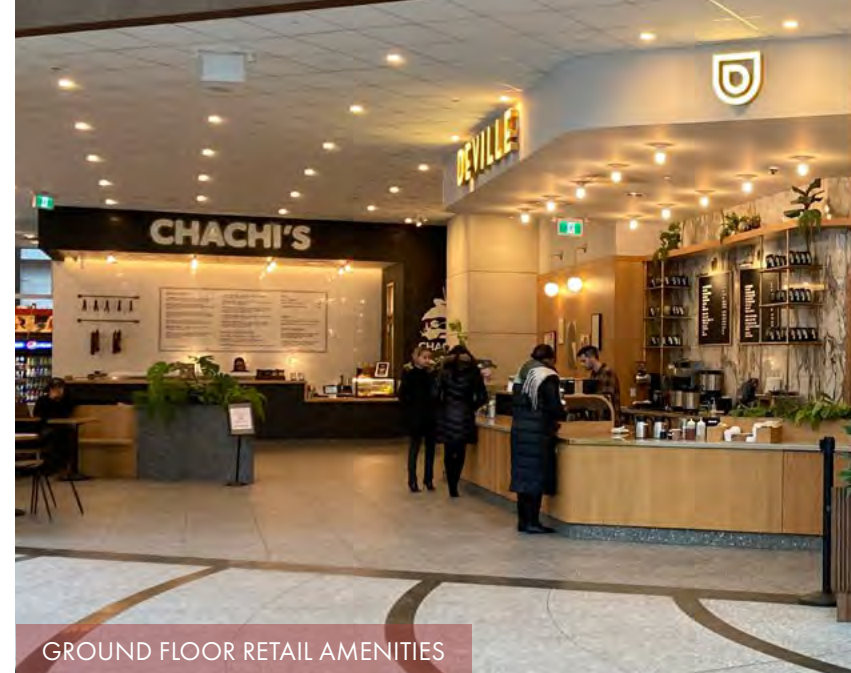
GROUND FLOOR RETAIL AMENITIES