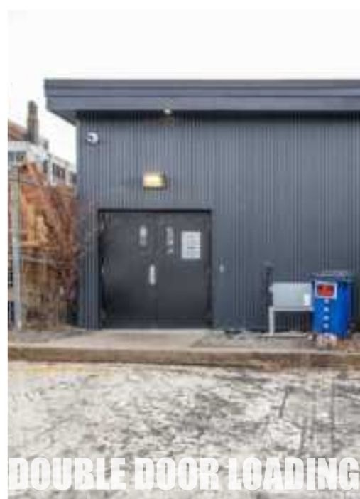
DOUBLE DOOR LOADING