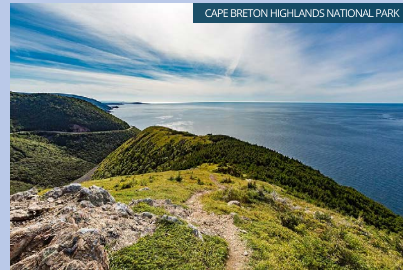
CAPE BRETON HIGHLANDS NATIONAL PARK