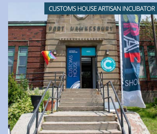
CUSTOMS HOUSE ARTISAN INCUBATOR