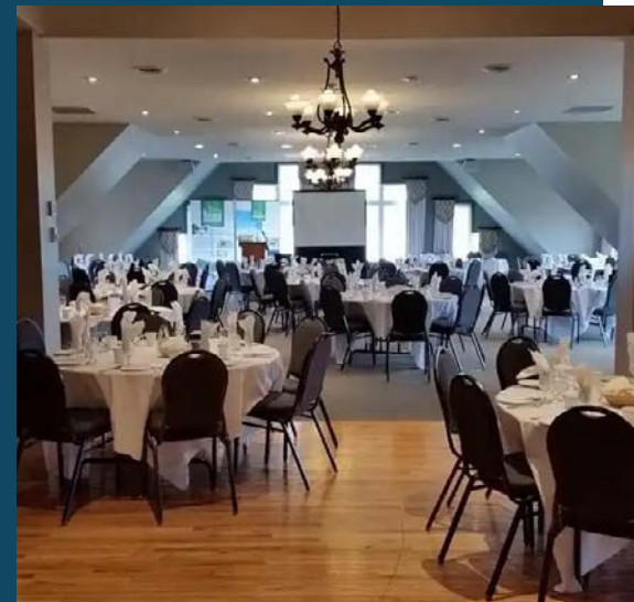
THE CLUBHOUSE DUNDEE'S