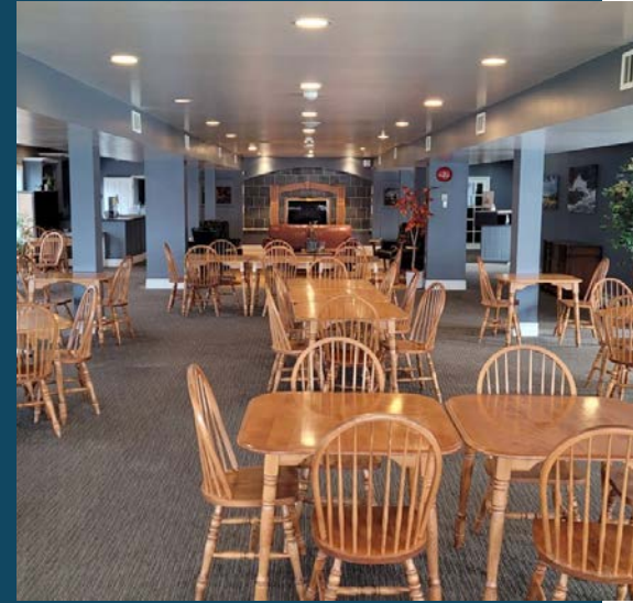
MACRAE'S RESTAURANT AND LAKE FRONT PATIO