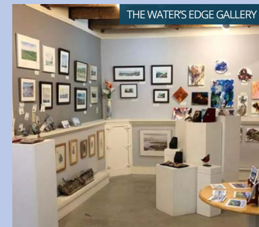
THE WATER'S EDGE GALLERY