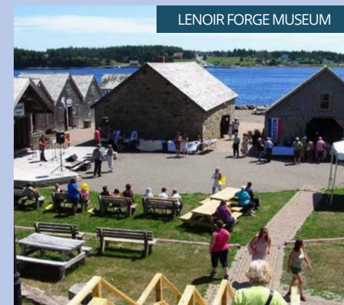
LENOIR FORGE MUSEUM