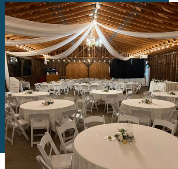
BRAS D'OR LAKE