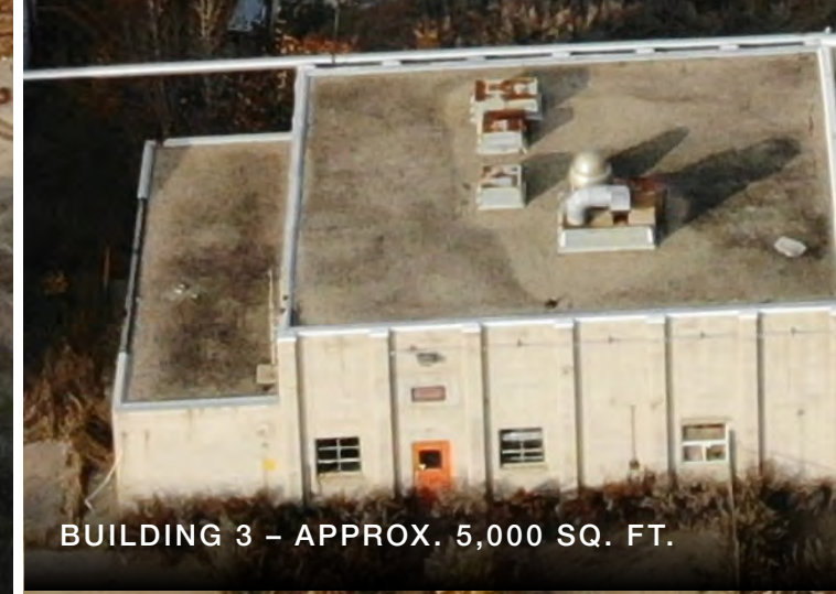
BUILDING 3 – APPROX. 5,000 SQ. FT.