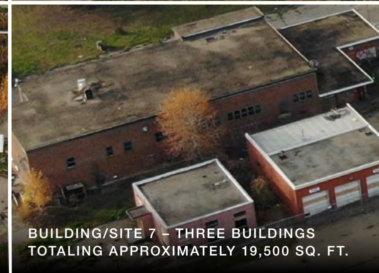
BUILDING/SITE 7 – THREE BUILDINGS TOTALING APPROXIMATELY 19,500 SQ. FT.