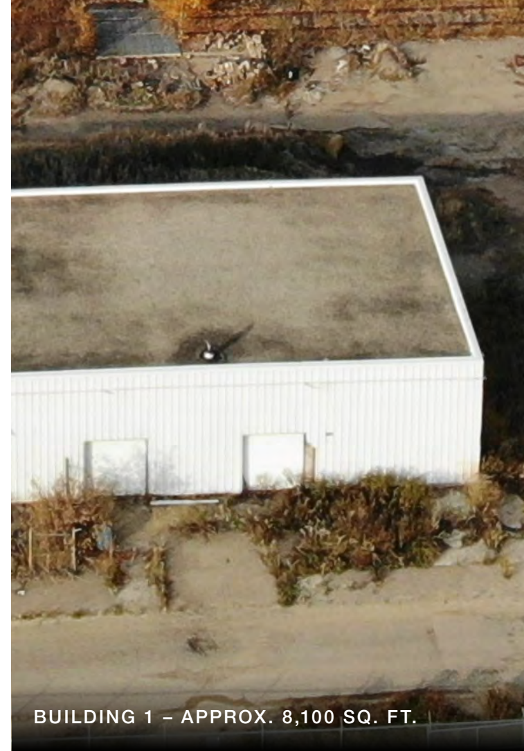
BUILDING 1 – APPROX. 8,100 SQ. FT.

Location: Near direct access to the Anthony Henday Freeway with close proximity to the Aurum Industrial Park and the Edmonton Waste Management Centre, in addition to other major transportation routes (Yellowhead Trail/Hwy 16, Sherwood Park Freeway, and Highway 15)