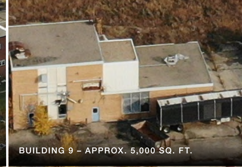
BUILDING 9 – APPROX. 5,000 SQ. FT.