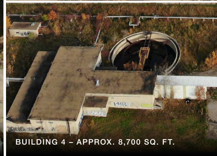
BUILDING 4 – APPROX. 8,700 SQ. FT.