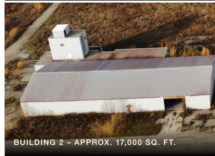
BUILDING 2 – APPROX. 17,000 SQ. FT.