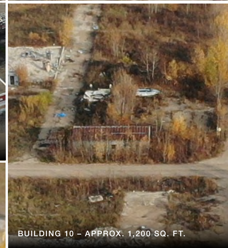
BUILDING 10 – APPROX. 1,200 SQ. FT.

*BUILDINGS HAVE LIMITED USABILITY IN CURRENT CONDITION