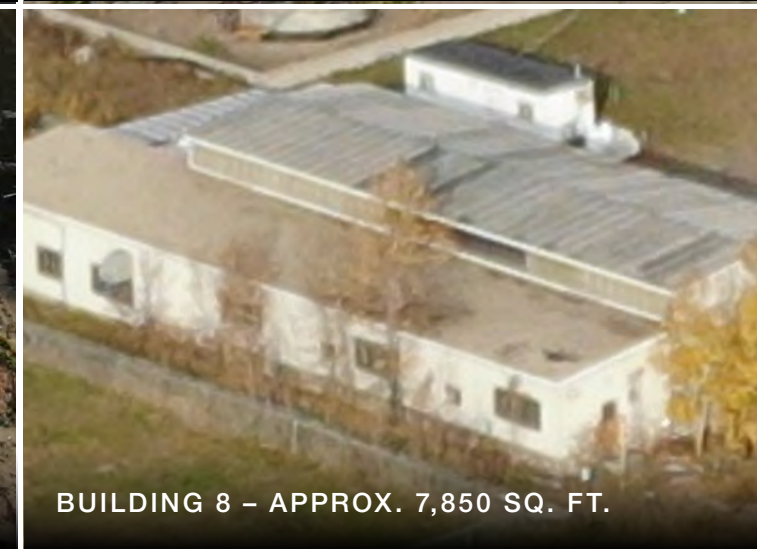
BUILDING 8 – APPROX. 7,850 SQ. FT.