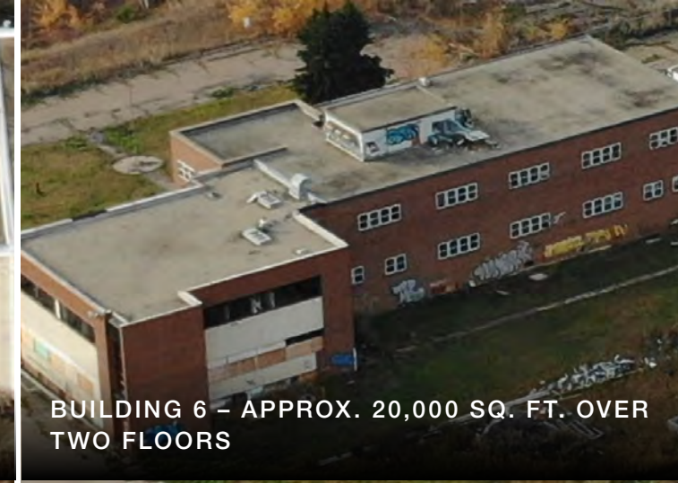
BUILDING 6 – APPROX. 20,000 SQ. FT. OVER TWO FLOORS