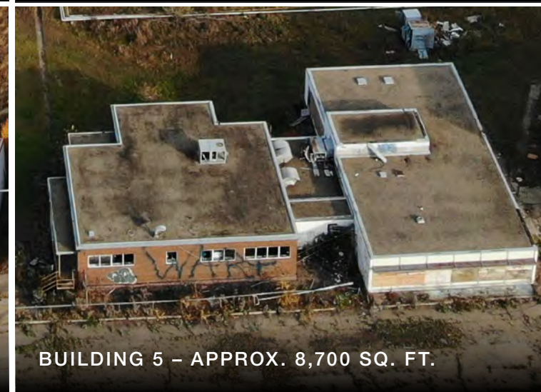
BUILDING 5 – APPROX. 8,700 SQ. FT.