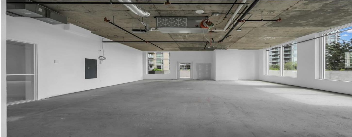
405 2992 Glen Dr Coquitlam