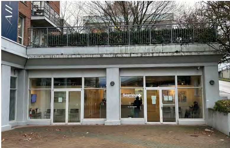
Corner of Fir Street and 7th Avenue