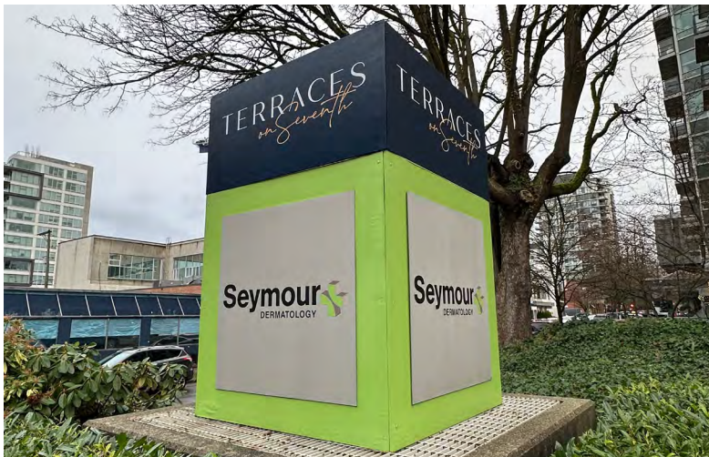
Pylon Sign Opportunity