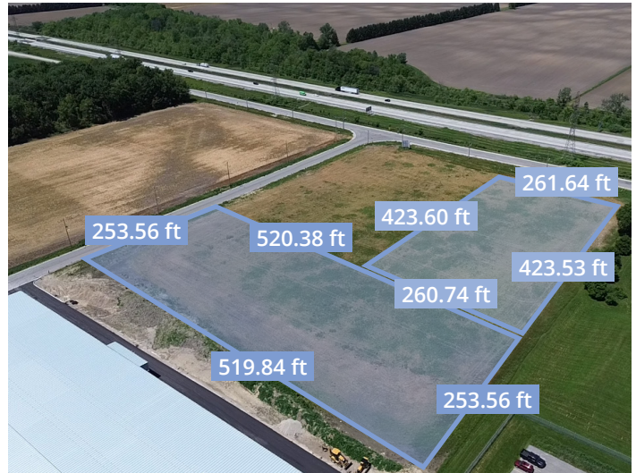
Highway 401 West to Windsor