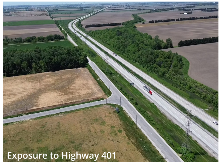
Exposure to Highway 401