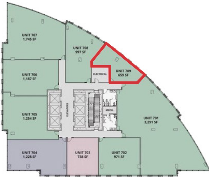
7 th Floor