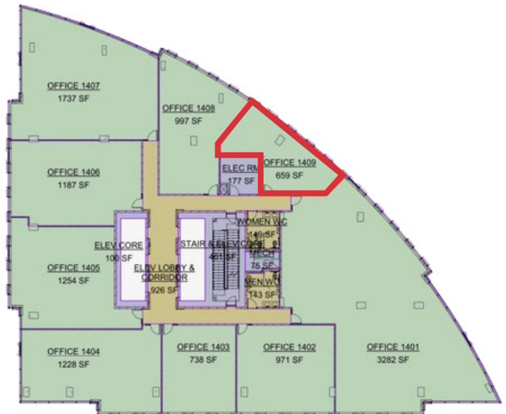
14 th Floor