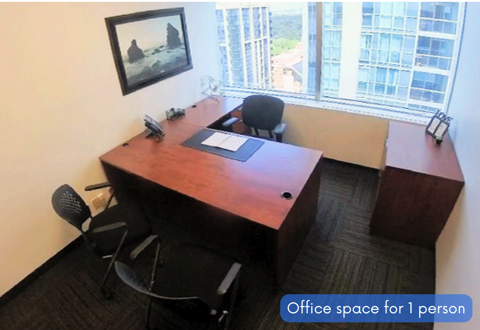
Office space for 1 person

Swift Offices provides flexible furnished office space, virtual office, and meeting facilities with a distinctive edge in technology.