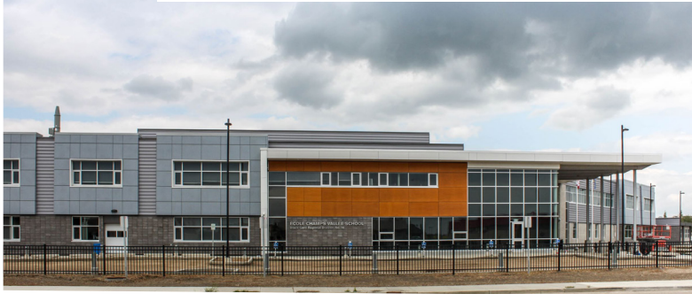
École Champs Vallée School