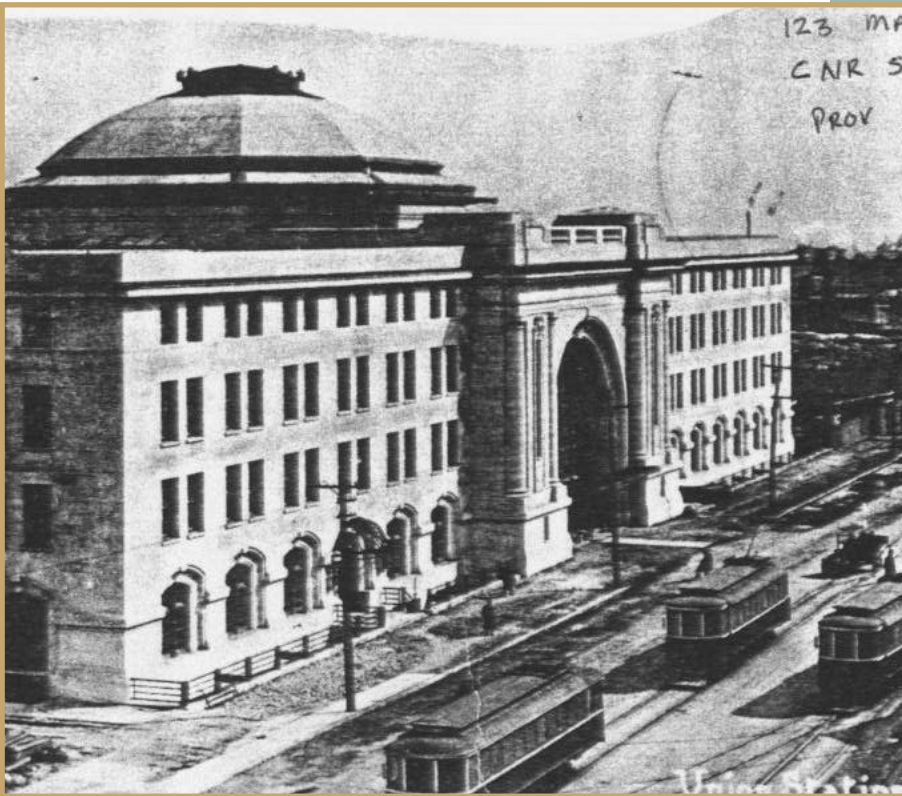
Union Station when it opened in 1911

The Forks receives approximately four million visits annually. An annual economics review conducted by InterGroup Consultants determined the economic impact of the whole of the Forks site to be $165 million.