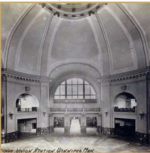
View of the rotunda - circa 1918