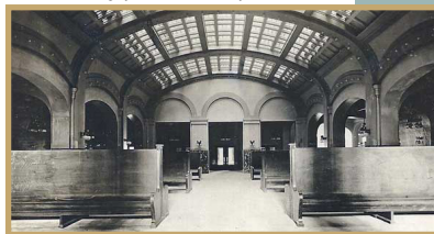
Waiting room - circa 1918

Constructed in 1908, this building has a lot of history and character. The beautiful architecture stands true as Union Station was designated a National Site of Canada.