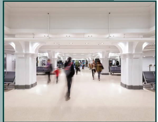
Passenger waiting area