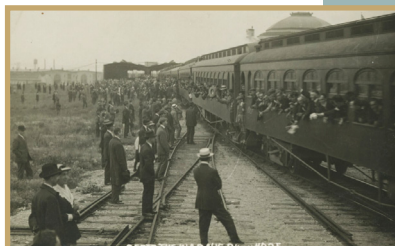
WWI Military personnel depart Union