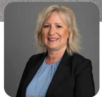
PROPERTY MANAGER & LEASING AGENT