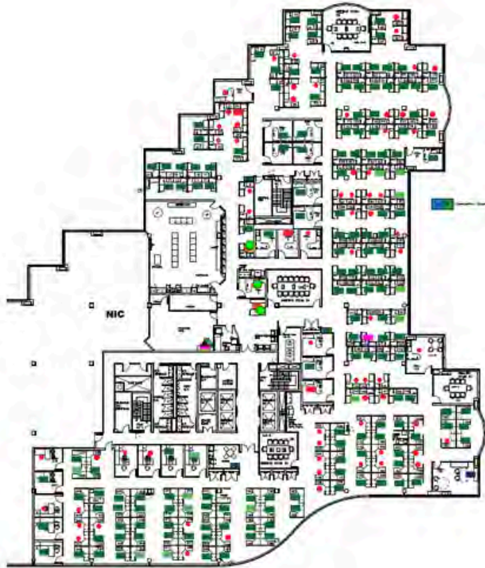
5TH FLOOR • 27,639 SF