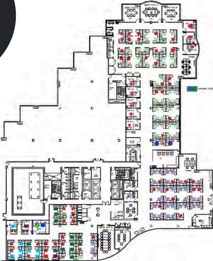
6TH FLOOR • 21,358 SF