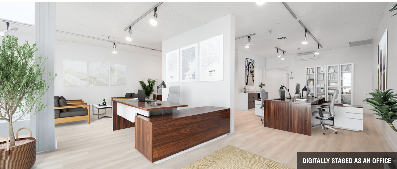
DIGITALLY STAGED AS AN OFFICE