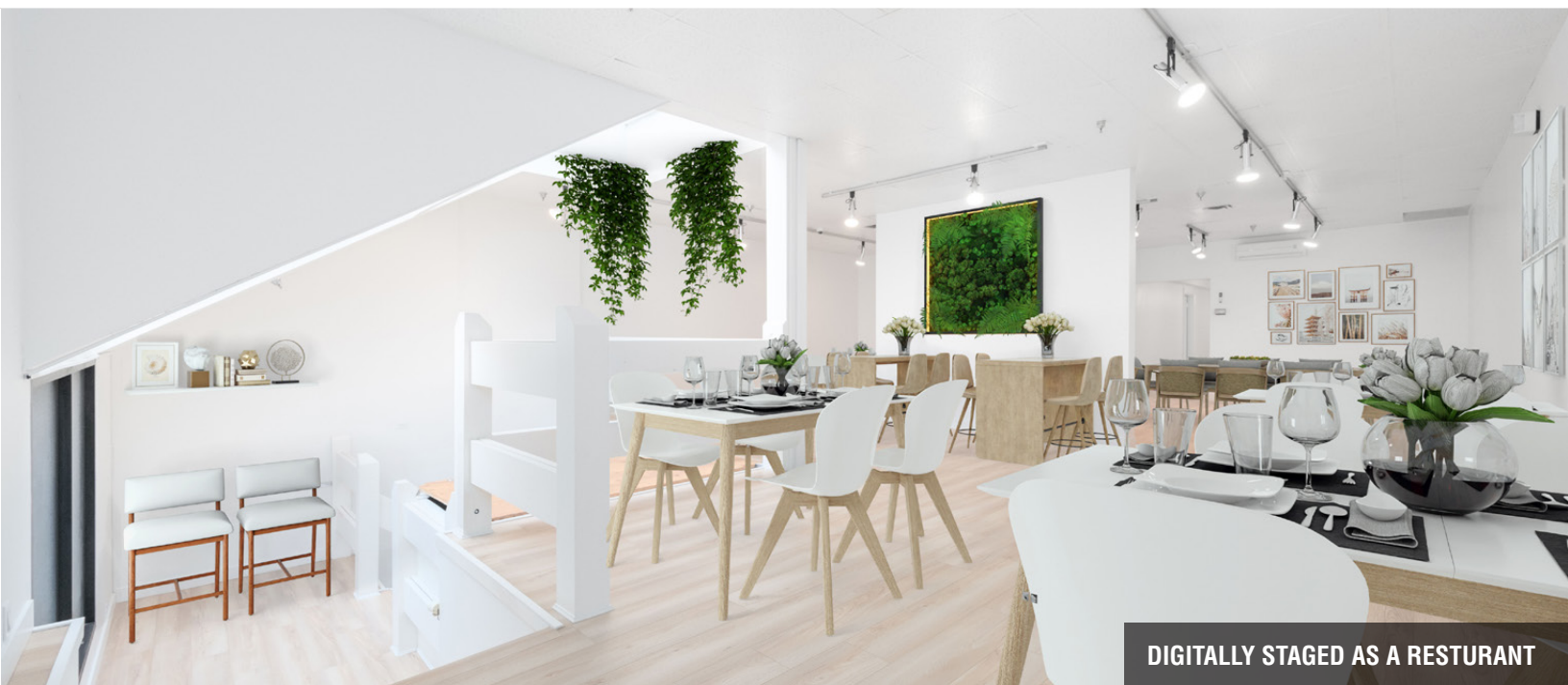
DIGITALLY STAGED AS A RESTURANT