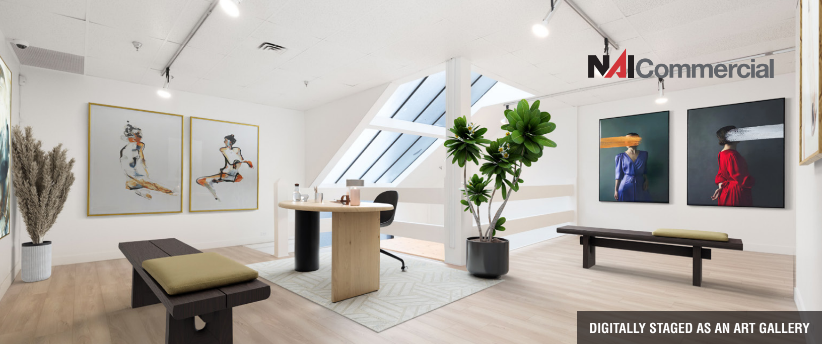
DIGITALLY STAGED AS AN ART GALLERY