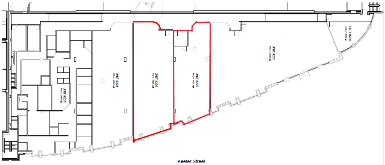
Second floor commercial units

*Floor plans are provided for illustrative purposes only