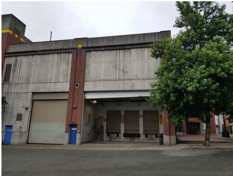
Loading bay - Georgia Street