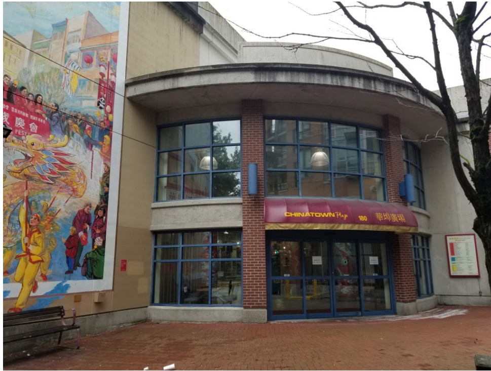
Rear lane entrance - Georgia Street