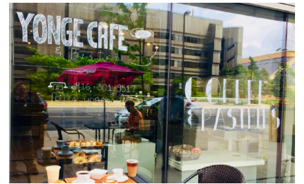
YONGE CAFE & BISTRO