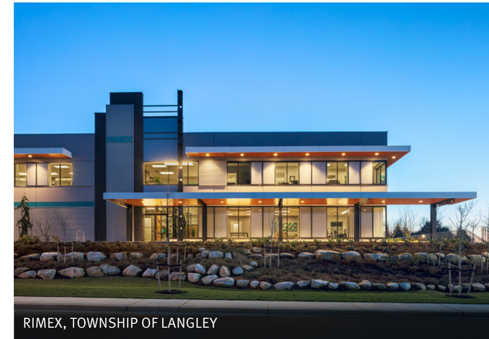
RIMEX, TOWNSHIP OF LANGLEY