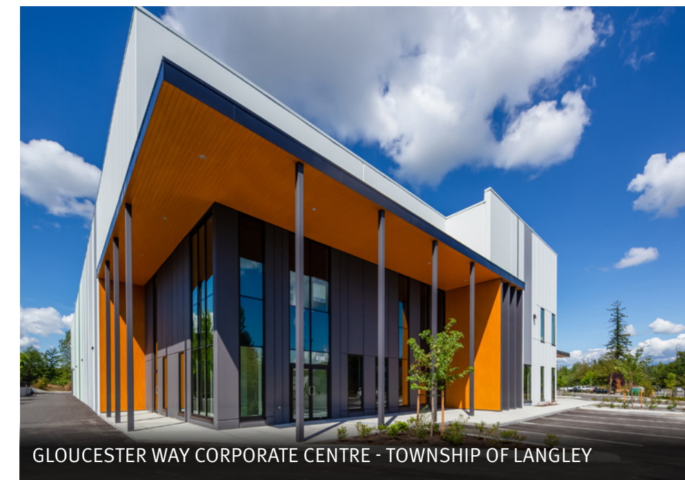
GLOUCESTER WAY CORPORATE CENTRE - TOWNSHIP OF LANGLEY