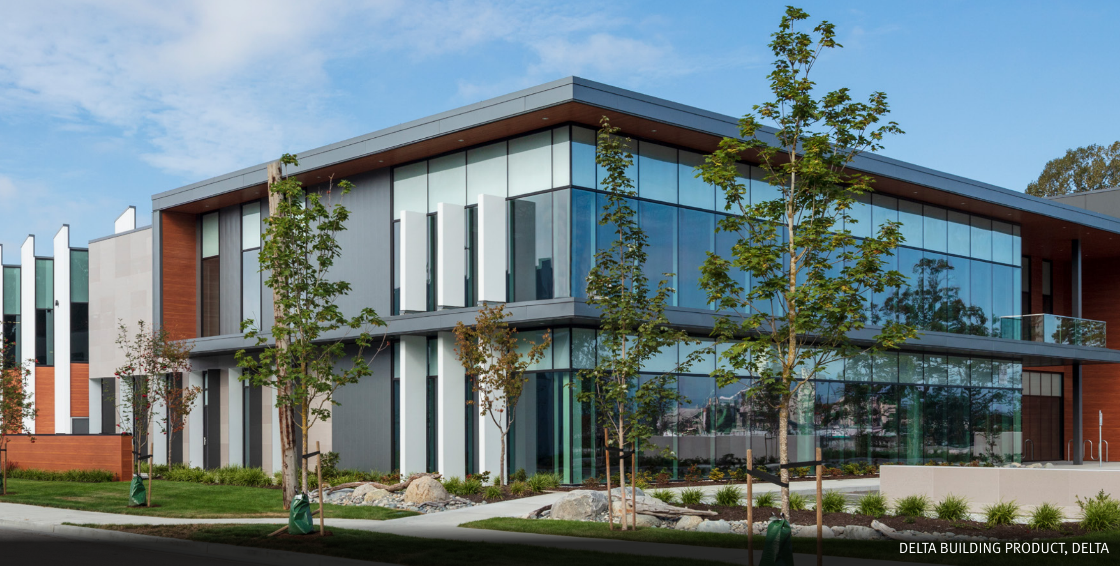
DELTA BUILDING PRODUCT, DELTA