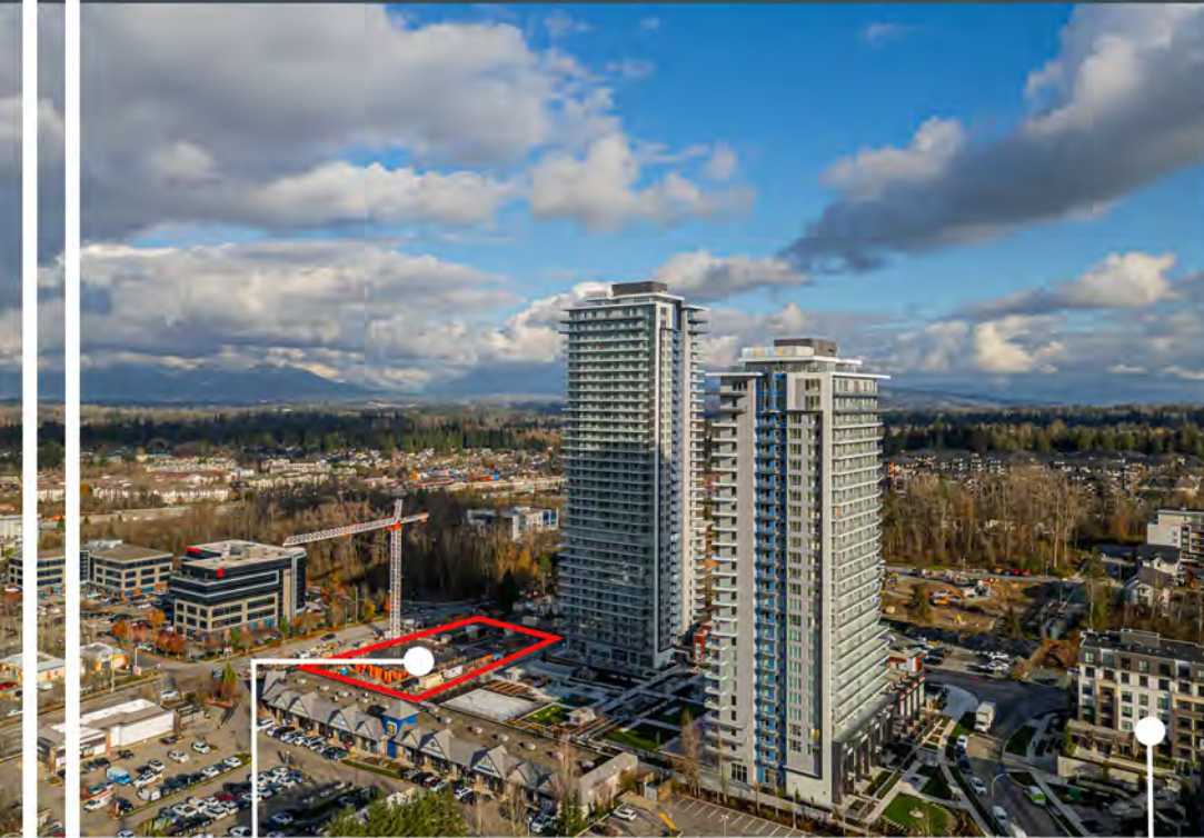
North Village Condos

With over 80 dedicated commercial parking stalls, including EV charging stations, North Village Condos is designed to accommodate local entrepreneurs seeking a high-exposure, pedestrian-friendly location. This is an excellent opportunity to purchase retail strata in a high-growth area, offering long-term value in one of the region's most desirable commercial hubs.