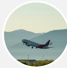
7 MINUTE DRIVE to YVR Airport