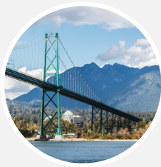
5 MINUTE DRIVE to Access Highway 99