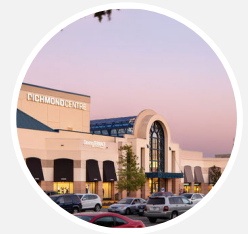
8 MINUTE DRIVE to CF Richmond Centre