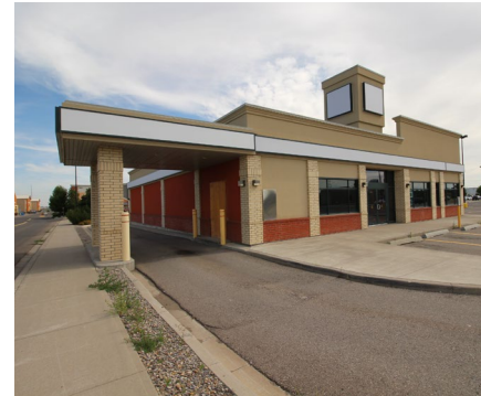
Unit E1 4,975 SF Drive-thru pad site opportunity Immediate Possession Available