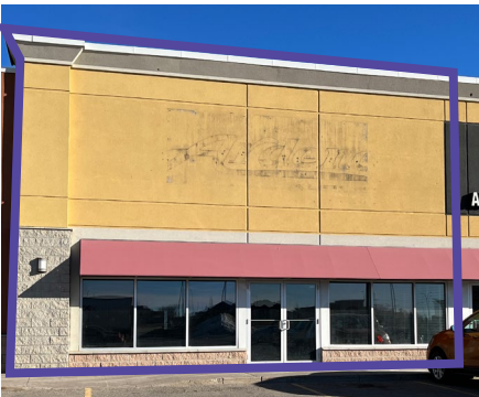
Unit H3 3,031 SF Open concept CRU opportunity Immediate Possession Available