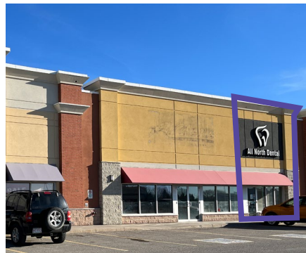
Unit H4 1,533 SF