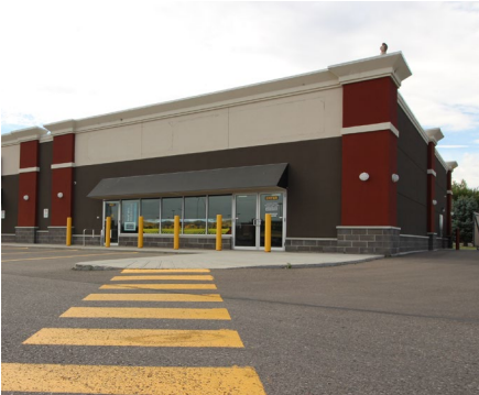
Unit D1 3,409 SF End cap unit & turn-key liquor store opportunity Immediate Possession Available