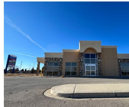
Unit M1 4,948 SF Drive-thru pad site opportunity Immediate Possession Available