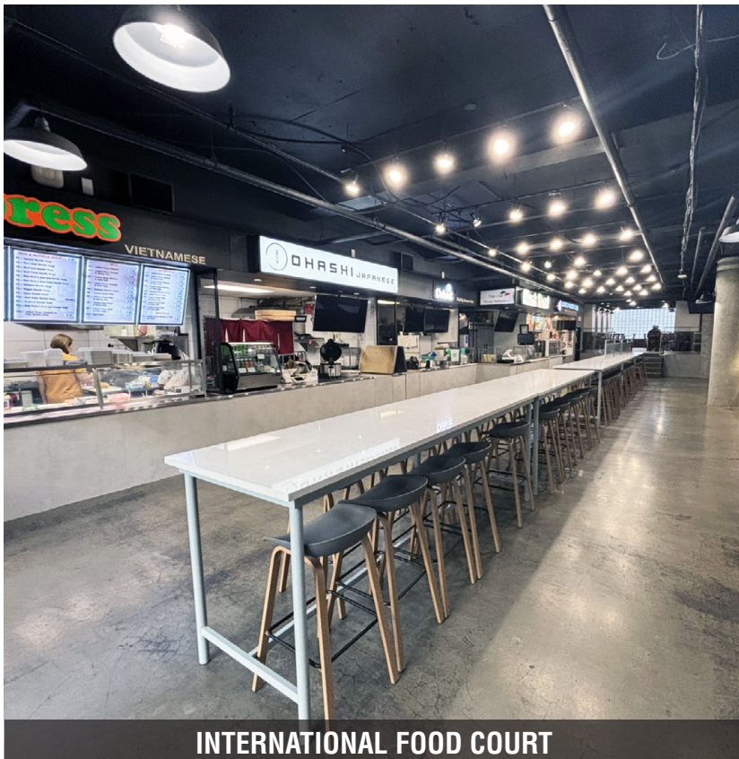
INTERNATIONAL FOOD COURT