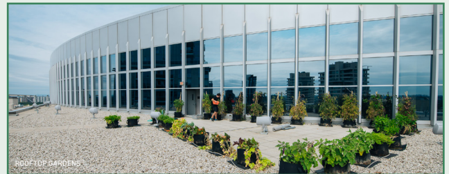
ROOF TOP GARDENS