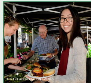
TENANT APPRECIATION EVENTS